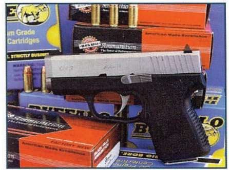
The Kahr CM 9 is a high quality, American-made product that combines power, reliability and shooter comfort with maximum concealability.

There are fewer machining operations on the slide. The engraving and finish are simplified though remain as attractive as need be and the pistol is sold with a single flatbased, 6-round magazine (obliging the savvy buyer to order a spare). The 7-round thumb extension unit would certainly make sense for a backup. The slide stop is a product of metal injection molding rather than machining, a process deplored by purists. It is a cost saving expedient with proponents as well as detractors.